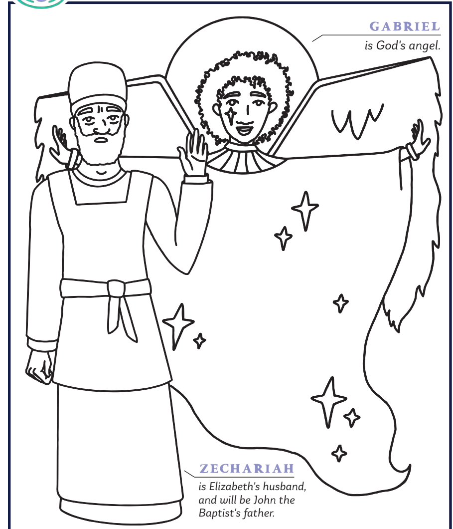
GABRIEL is God's angel.

MAIN IDEA Sometimes it's hard to believe good news.